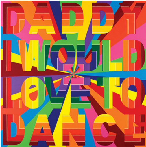
Deborah Kass's "Daddy" from 2008