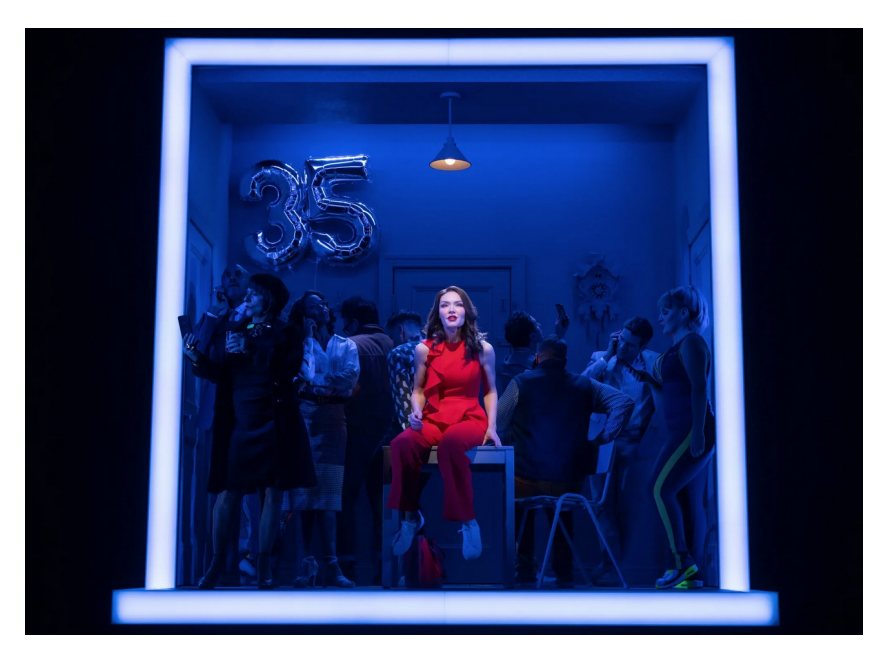
Lenk in a scene from the show. "The image of all of them crowding that small room," Sondheim said, "gives a whole other meaning to the title, 'Company,' cause they're smothering her."

You also wrestled with how to handle an exchange between Bobbie and her friend Joanne. In the original, Joanne propositions Bobby; in this version, Joanne makes a different suggestion.