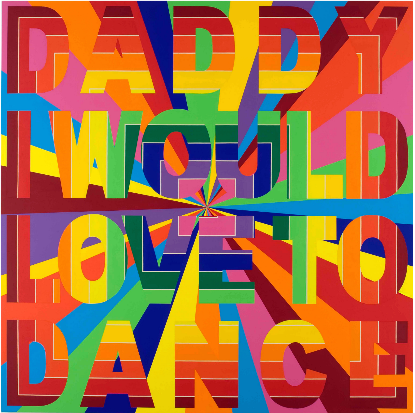
Deborah Kass, Daddy , 2008, acrylic on canvas, 78 x 78 in

During the mid-2000s, Kass' feel good paintings for feel bad times blended the abstract visual languages of artists like Ellsworth Kelly and Frank Stella with lyrical references from pop music and Post-War Broadway, presciently both suggesting and interrogating the current "Make America Great Again" zeitgeist. Recent works include the large-scale OY/YO sculpture, which first appeared in Brooklyn Bridge Park and later outside the Brooklyn Museum, and her newest painting series No Kidding , which addresses issues like institutional racism, women's health, and climate justice.