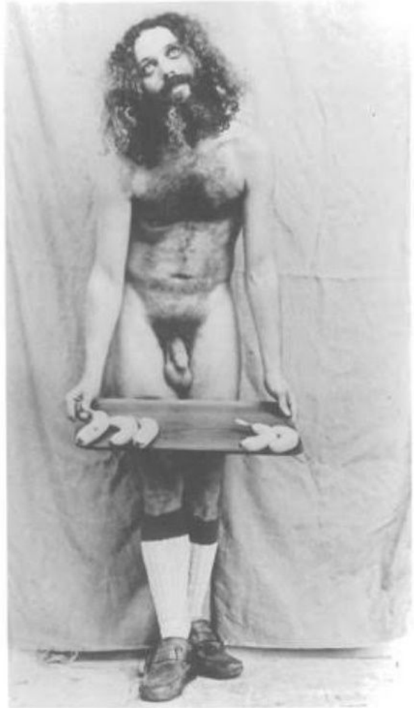
Left: Buy My Apples, from a late 19-century popular French magazine. Right: Linda Nochlin, Buy My Bananas, 1972.