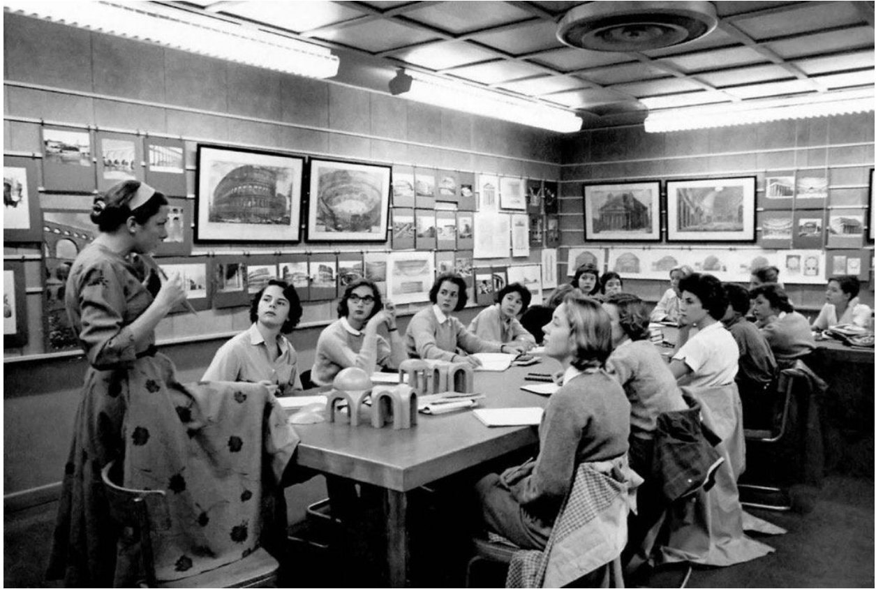
Linda Nochlin teaching at Vassar College in 1959.