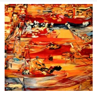
Review: Regina Scully | Japanese Landscape – Inner Journeys Apr 26, 2017