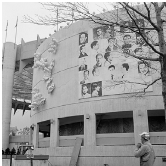
“Thirteen Most Wanted Men” by Andy Warhol, 1964. Installed at the New York State Pavilion at the World’s Fair.

Young curators disguised as felons—priceless. Today the works frame some of the most standout professionals in the curatorial field. To the uninitiated, their identities are a bit of an inside joke, so here’s the punchline: they include