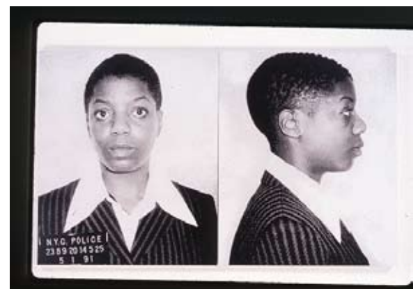
“America's Most Wanted, Thelma G.” by Deborah Kass, 1998. Acrylic and silkscreen on canvas, diptych, 48 x 40 inches each.